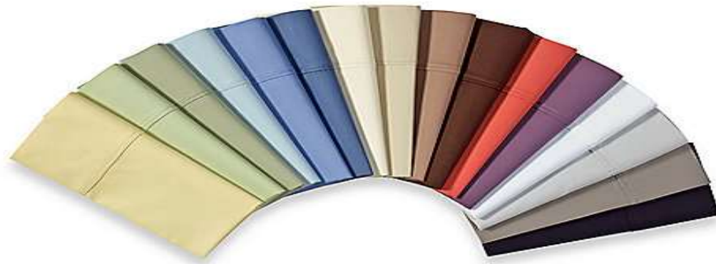
Colored Bed sheet sets