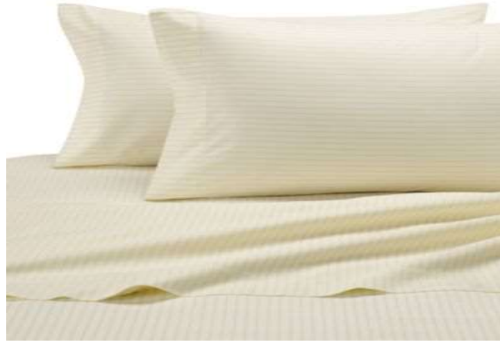
Stripe Bed sheet sets