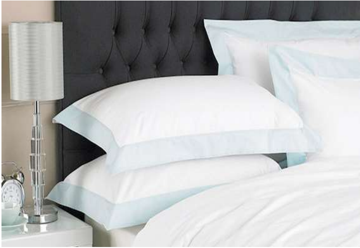
White Bed sheet sets